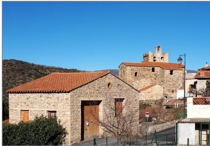
The church in Sirach