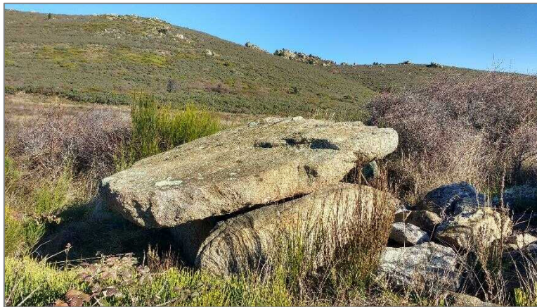
Dolmen Pla de l'Arca