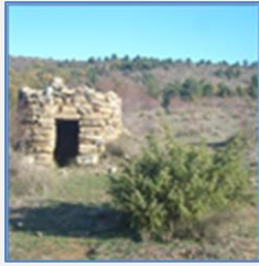
Vernet-les-Bains Corneilla - Villefranche 5 hours; climb: 750m